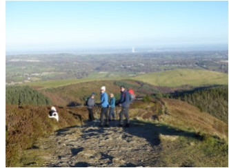
Ramblers - Moel Famau