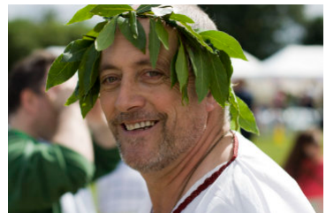
At the fete again