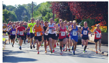
Sutton six and fun fun